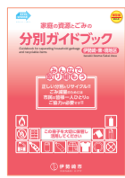
Iseaki, Azuma and Sakai district version

Guide Book for separating resources and waste