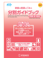
Isesaki, Azuma and Sakai district version

Guide Book for separating resources and waste